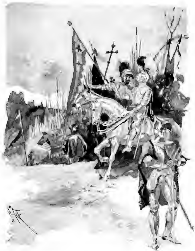
"MONARCHS! YE WHOSE ARMIES STAND HARNESSED FOR THE BATTLE-FIELD. — Page 255.